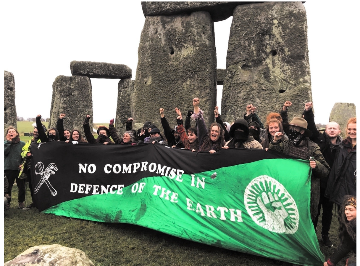
Sacred Earth Activism

They have approached HAD to support their campaign